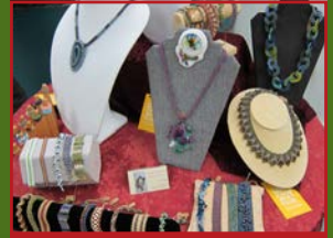
Artworks on the Summit Kane