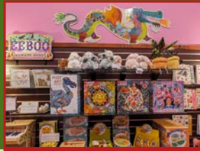
Marilyn Horne Museum Gift Shop Bradford