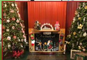
America's First Christmas Store Smethport