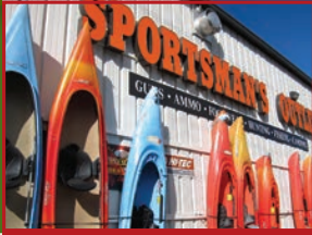
Sportsman's Outlet Bradford