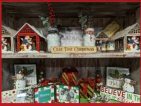
Main Street Mercantile Bradford

Nearby in the Allegheny National Forest Region in Pennsylvania