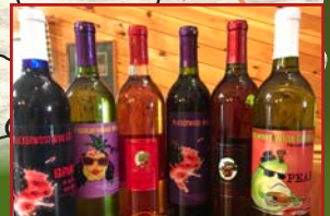
Flickerwood Wine Cellars Kane