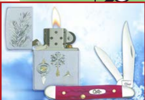
Zippo/Case Museum Gift Shop Bradford