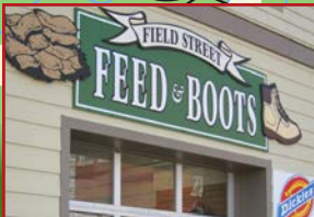
Field Street Boots Kane