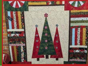
Little Fabric Garden Bradford