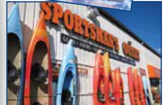
Sportsman's Outlet, Bradford