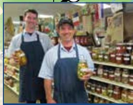
Jack Bell's Meat Market, Kane