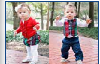
Fluffy Baby Boutique, Bradford