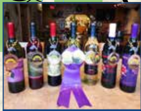
Flickerwood Wine Cellars, Kane