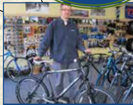
Just Riding Along, Bradford