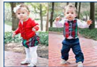
Fluffy Baby Boutique, Bradford