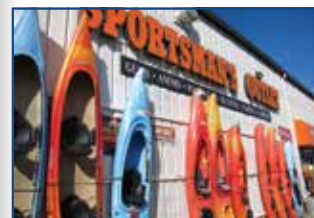
Sportsman's Outlet, Bradford