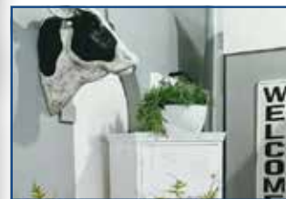
Olde Schoolhouse Village Shoppes, Eldred