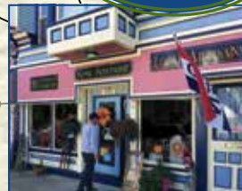
Rose Boutique, Smethport