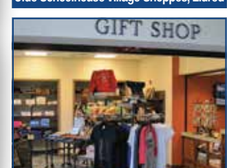
Kinzua Bridge Visitors Center Artisan Shop, Mt. Jewett

Bear Hollow Country Store Reclaimed barn wood furniture. Log home, bear, and antler décor, and hand-carved benches with bear or elk motifs. Natural Edge Pennsylvania hardwood furniture. April – December 25. Saturday and Sunday 10 am to 5 pm. 13867 Route 6. 814-331-0023.