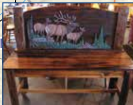
Bear Hollow Gift Shop, Smethport