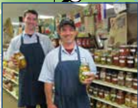
Jack Bell's Meat Market, Kane