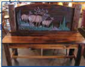
Bear Hollow Gift Shop, Smethport