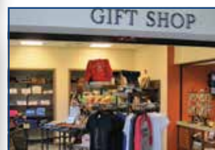
Kinzua Bridge Visitors Center Artisan Shop, Mt. Jewett

Bear Hollow Country Store Reclaimed barn wood furniture. Log home, bear, and antler décor, and hand-carved benches with bear or elk motifs. Natural Edge Pennsylvania hardwood furniture. April – December 25. Saturday and Sunday 10 am to 5 pm. 13867 Route 6. 814-331-0023.