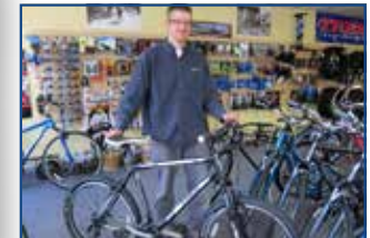
Just Riding Along, Bradford