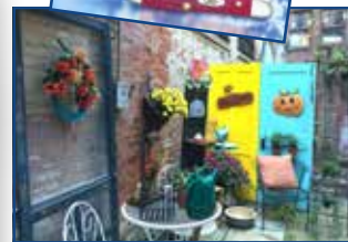
Timeless Treasures, Bradford