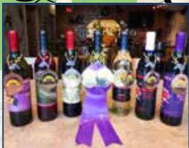
Flickerwood Wine Cellars, Kane