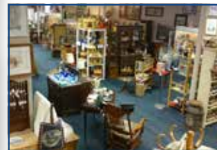
Main Street Mercantile, Bradford