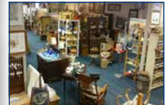
Main Street Mercantile, Bradford