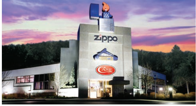
DAY 2 Breakfast at the Hotel. Tour a museum – Zippo/Case, Marilyn Horne, Penn Brad Oil Museum or the