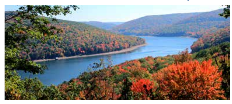
Longhouse National Scenic Byway rated #1 fall scenic drive in Pennsylvania by USA Today.