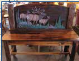
Bear Hollow Gift Shop, Smethport