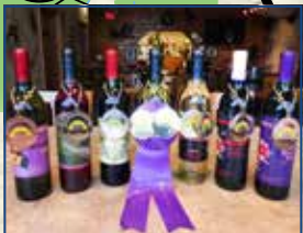
Flickerwood Wine Cellars, Kane