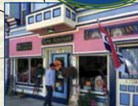
Rose Boutique, Smethport