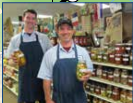
Jack Bell's Meat Market, Kane

TAX FREE Shopping in Pennsylvania Clothing & Shoes