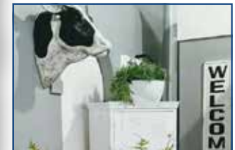
Olde Schoolhouse Village Shoppes, Eldred