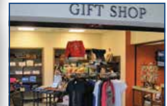
Kinzua Bridge Visitors Center Artisan Shop, Mt. Jewett

TAX FREE Shopping in Pennsylvania Clothing & Shoes