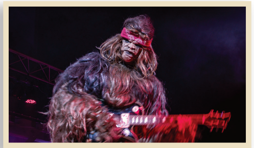
Viking Funeral Swedish Festival • Mt. Jewett, PA • August

Squatchfest A "Big Foot" Music Festival • Kane, PA • July